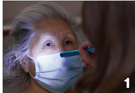
Patient being examined in the Emergency Department at The Mount Sinai Hospital by a Mount Sinai Stroke Service resident.

Untreated, eye strokes cause permanent, devastating vision loss in the affected eye. To dissolve the clot, an infusion of tissue plasminogen activator (tPA) needs to be administered into the ophthalmic artery. But there is a very small window of opportunity to intervene. To prevent permanent blindness, blood flow to the retina must be restored within about 12 hours—and ideally within six hours or less. Researchers at New York Eye and Ear Infirmary of Mount Sinai (NYEE) have found that, when used within