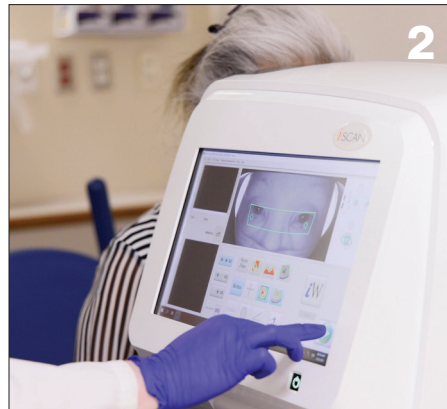
Resident administering an OCT scan for suspected central retinal artery occlusion (CRAO).

12 hours, intervention with tPA is safe and leads to significant visual improvement ( Published in Clinical Ophthalmology, 2021* ).